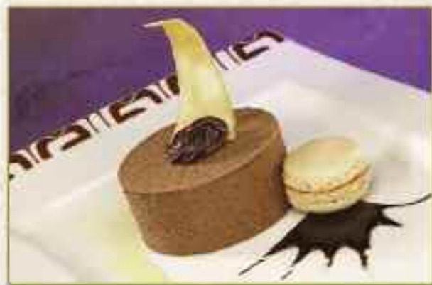
Opus #208 A silky chocolate praline sabayon mousse with two layers of sprinkled hazelnut chocolate Dacquoise topped with a velvety dark chocolate finish. (24 x 3" rounds per case) Serve Cold