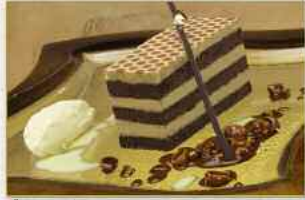
Hazelnut Toffee #145 Layers of chocolate genoise filled with hazelnut mousse. Serve cold with bourbon crème anglaise or praline crème anglaise. (2 x 16" strips per case)