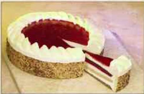
Edelweiss #111 Almond Dacquoise, raspberry coulis, white chocolate mousse, ladyfingers, and crunchy bottom (2 x 9" rounds per case) Serve Cold.