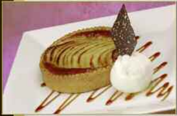
Apple Tartlet #218 Fresh Granny Smith Apples filled with almond cream in pure butter short dough (24 x 4" tartlets per case) Serve Room Temperature.