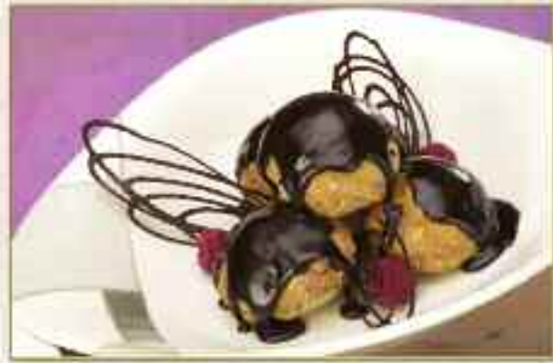
Profiterolles #017 Cream puff filled with Spanish Vanilla Cream. Serve Half Frozen topped with hot chocolate sauce. (2 Bags/ 56 pcs/per bag)