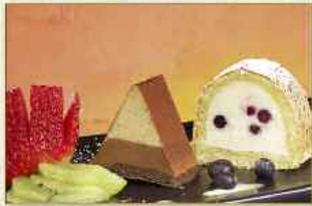
Duet #217 Triangle: Praline Mousse and chocolate mousse finished with dark chocolate coating. (2 x 16" sets per case) Serve Cold Mini Roulade: Lemon Mousse with blueberries. Joconde incrustated pistachio and lemon zest. Serve Cold.