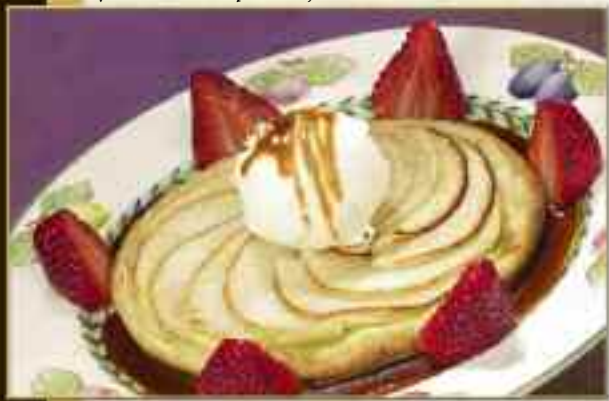
Apple Tart #050 Pure butter puff dough, fresh baked Granny Smith apples. (24 x 6" tarts per case) Serve Hot.