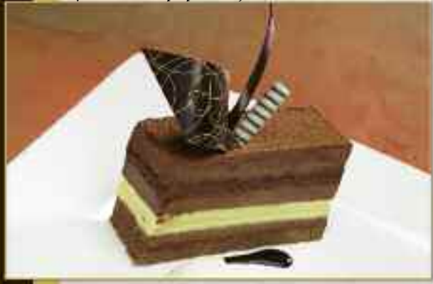
Allegro #115 Bittersweet Chocolate Mousse with Crème Brulee and Chocolate Sponge soaked in Kirsch Syrup. Bottom made with Crunchy Wafers and Praline. (2 x 16" strips per case) Serve Cold.