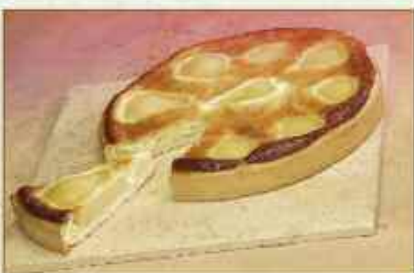
Pear Tart #151 Poached Pear with almond in sweet dough. Serve Room Temperature. (2 x 9" rounds per/cs.)