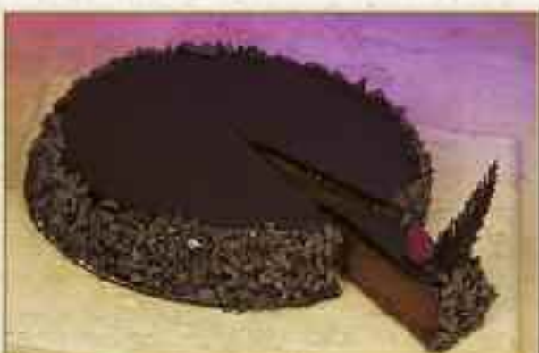
Sacher #117 Flourless chocolate cake topped with chocolate glaze. Better Served at Room Temperature. (2 x 9" rounds per case)