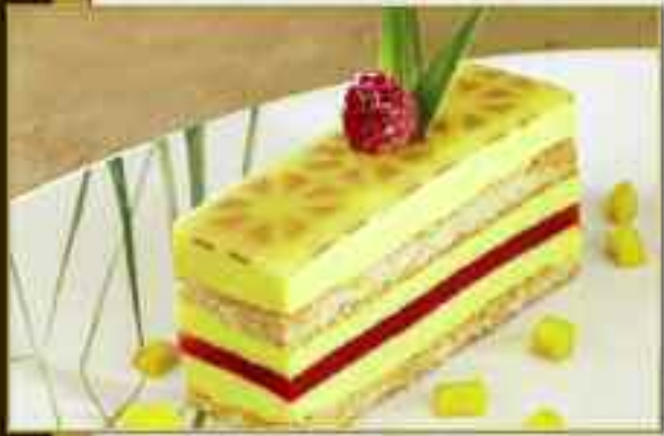
Equator #157 Coconut Mango Mousse. Raspberry Passion Fruit Coulis. Coconut Dacquoise (2 layers of toasted coconut meringue) Chocolate Décor sprayed with neutral glaze. (2 x 16" strips per case) Serve Cold.