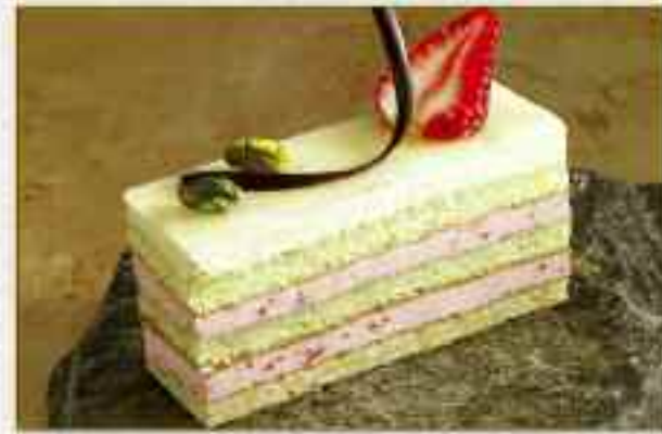
Primavera #143 Layers of Strawberry and Pistachio Mousse between layers of vanilla sponge and kirsch syrup. Finished with a glossy glaze. (2 x 16" strips per case) Serve Cold.