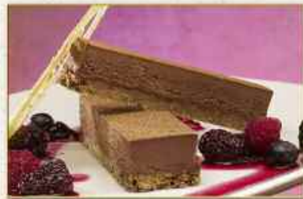
Chocolate Crunch Bar #140 Wonderfully crunchy bottom made of imported wafers and praline topped with a silky chocolate mousse (4 x 12" strips per case) Serve Cold