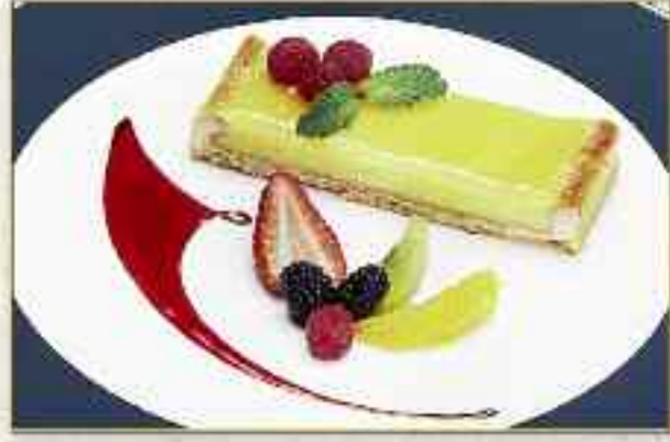
Lemon Tart #153 Buttery Shortbread crust filled pure lemon curd finished with lemon glaze. Serve Cold (2 x 16" strips per case.)