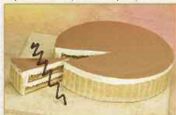
Tiramisu Round #112 Ladyfingers soaked with coffee liquor filled with mascarpone mousse. Serve Cold. (2 x 9" rounds per/cs.)