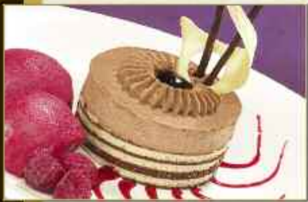
Velvet #003 Lined chocolate almond sponge filled with chocolate raspberry mousse and fresh raspberries. Topped with a layer of velvet chocolate. Serve Cold. (24 x 3" rounds per case)