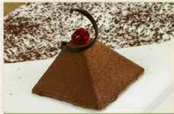
Pyramid #216 Rich chocolate mousse with raspberry coulis topped with sprayed chocolate. (24 x 3" pyramids per case) Serve Cold