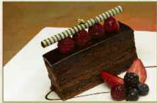
Romance #109 Pure Ganache filling with three layers of Chocolate Sponge soaked in Kirsch Syrup and finished with a Chocolate Mirror Glaze. (2 x 16" strips per case) Serve Room Temperature.