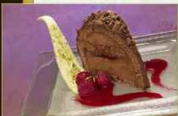
Chocolate Roulade #142 Chocolate sponge filled with dark chocolate mousse and raspberry preserve. Topped With chocolate shavings. Serve Cold. (2 x 12" pcs/cs)