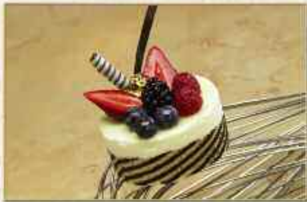
Vanilla Bourbon #001 Tahitian vanilla bean mousse. Two layers of sponge saturated with vanilla syrup. Lined with almond sponge. (24 x 3" rounds per case) Serve Cold