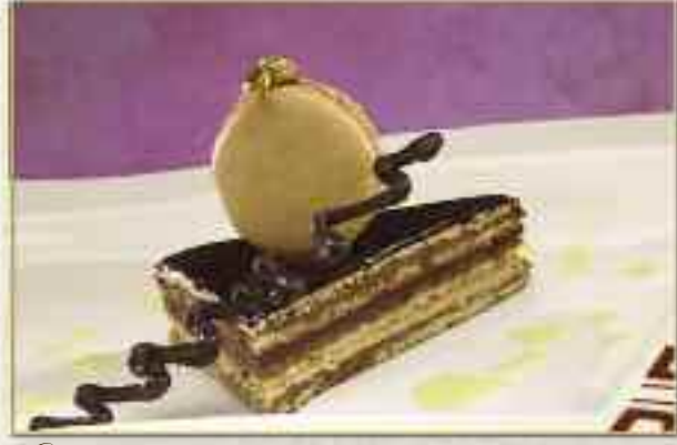
Opera #125 Layers of thin almond sponge soaked with espresso, filled with ganache and coffee butter cream. Serve room temperature, decorate with gold leaf. (4 x 12" strips per case)