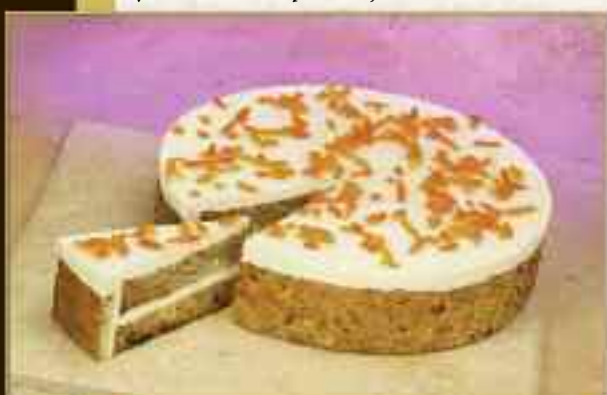
Carrot Cake #229 Carrot cake surrounded with diced almond joconde. Finished with cream cheese icing, clear glaze and shredded fresh carrots. Serve Room Temperature. (2 x 9" rounds per/cs)