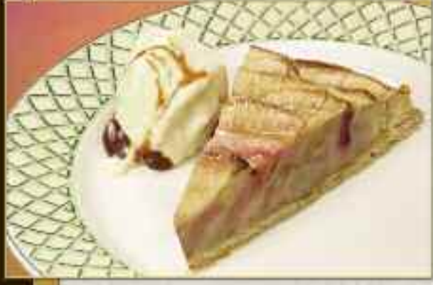
Normandy #150 Pure butter dough, fresh granny smith apples. Serve at room temperature. (2 x 16" strips per case)