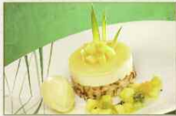
Exotic #002 An exotic mousse puree lined with coconut ladyfingers. Topped with exotic glaze (24 x 3" rounds) Serve Cold