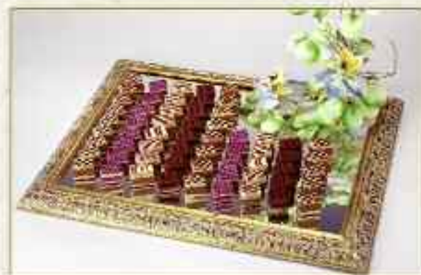
Petit Fours #160 4 Assorted Strips. Orange Curacao, Bitter Chocolate Caraibe, Maracuya (passion fruit Mousse and chocolate mousse.) Capucine (vanilla mousse and cassis mousse)