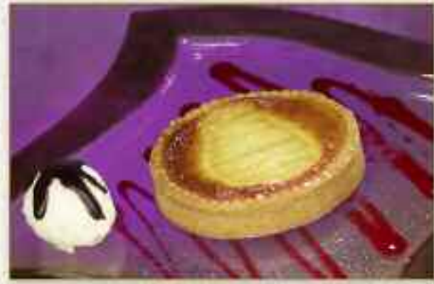
Pear Tartlet #219 Pouched Pear with almond cream in pure butter short dough (24 x 4" tartlets per case) Served Room Temperature