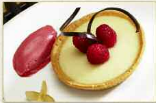
Key Lime Tartlet #221 Butter short dough filled with Key Lime curd & lime zest. Finished with Key Lime glaze. (24 x 4" tartlets per case) Serve Cold.