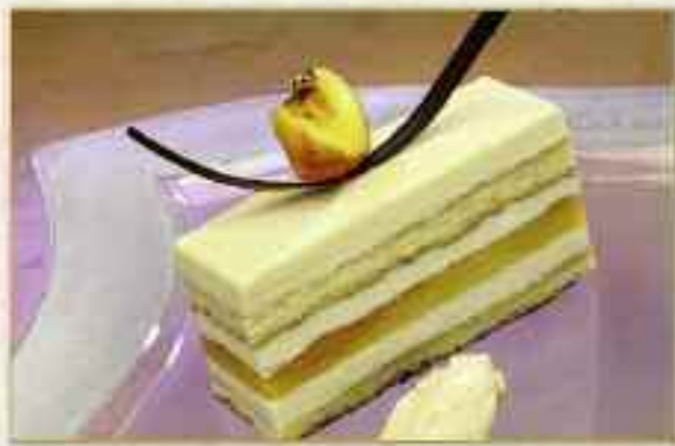
Georgia #108 White Chocolate Almond Amaretto mousse with Peach Coulis and two layers of Vanilla Sponge soaked in Peach & Amaretto Syrup. (2 x 16" strips per case) Serve Cold