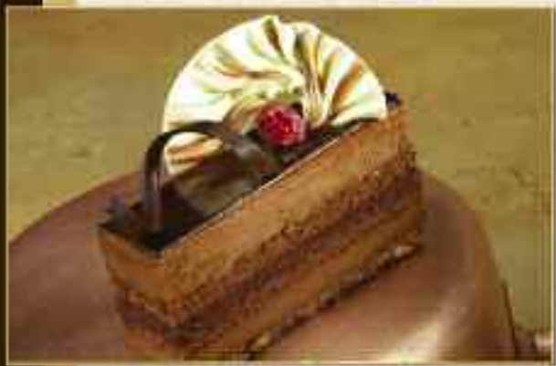
Nocturne #104 Bitter Sweet Chocolate Mousse with a layer of Raspberry Ganache and 2 layers of chocolate biscuit with one piece of Chocolate shortbread in the base. (2 x 16" strips per case) Serve Room Temperature.