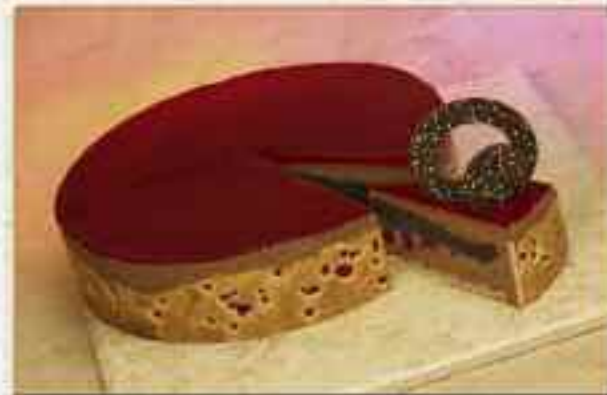
Chambord #172 Raspberry almond joconde filled with bittersweet chocolate mousse and fresh raspberries. A layer of chocolate sponge and dacquoise. Serve cold. (2 x 9" rounds per/cs.)