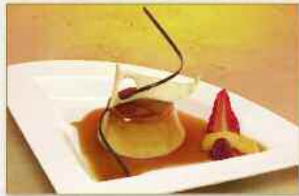
Crème Caramel #204 Crème Caramel. Serve Cold. (32 x 4 oz. servings per case.)