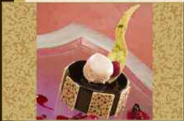
Marquise Au Chocolat #005 Bitter-sweet chocolate mousse with two layers of chocolate sponge. Soaked with kirsch syrup, top glaze chocolate mirror. Serve room temperature (24 x 3" rounds per case.)