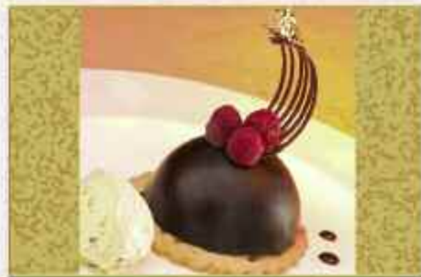
Dome #224 Chocolate Sabayon with chocolate dacquoise, raspberry coulis and short dough base. (24 x 3" domes per case) Serve Cold