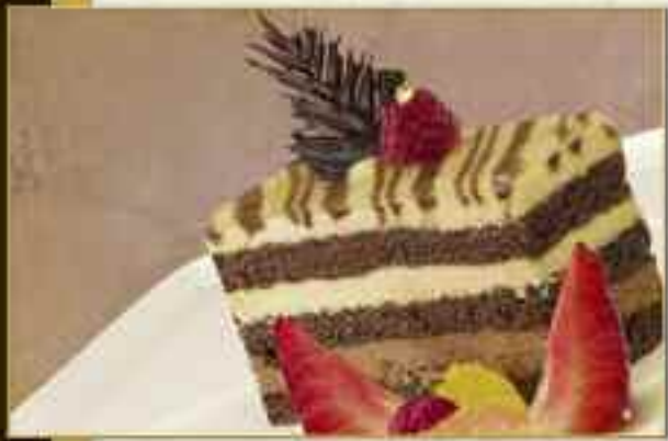
Chocolate Orange #134 Two layers of Chocolate Sponge soaked with Orange Curacao Syrup and layered with a semi-sweet chocolate sabayon and a fresh orange mousse. Serve Cold. (2 x 16" strips per case)