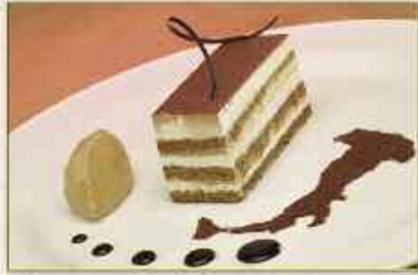
Tiramisu Strip #146 Ladyfingers soaked with coffee liquor filled with mascarpone mousse. Serve Cold (2 x 16" strips per case)