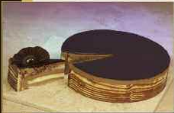
Imperial #107 Chocolate mousse, vanilla crème brulee, almond joconde with wood grain décor and vanilla sponge. (2 x 9" rounds per case) Serve Cold